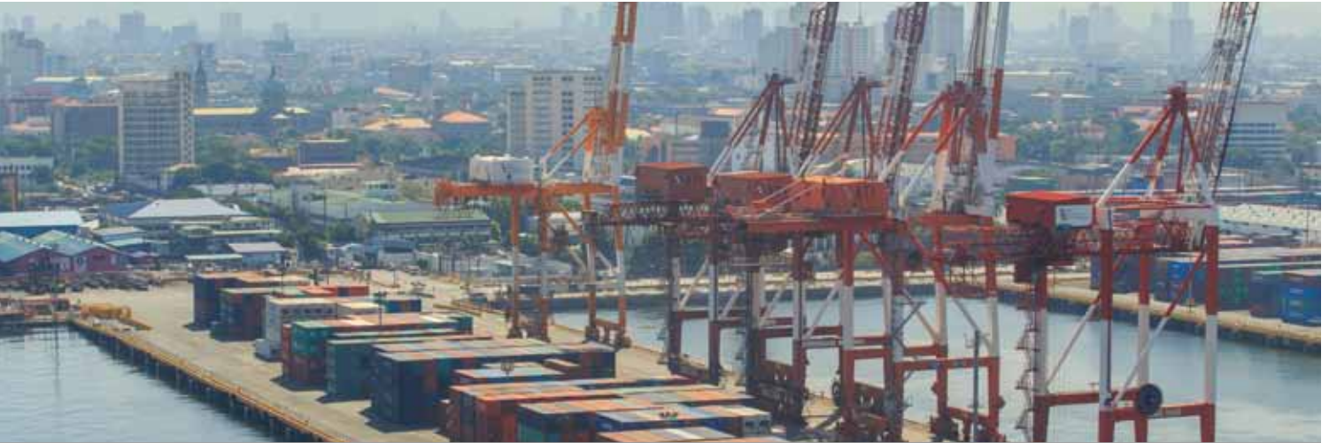
Manila North Harbour Port is the largest and fastest growing port in the Philippines. Transport operators throughout the Philippines' port sector are increasingly relying on York's reliable running gear.

With the huge Asian economies and their associated transport industries continuing to mature one feature increasingly stands out: that is, recognition of the value of using brands that can be trusted to deliver each and every time. A good example is the way in which the bustling ports of the region are increasingly turning to York Transport Equipment.