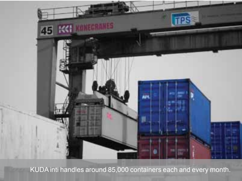
KUDA inti handles around 85,000 containers each and every month.

It's the right choice to continue using York for our port operation at Surabaya.